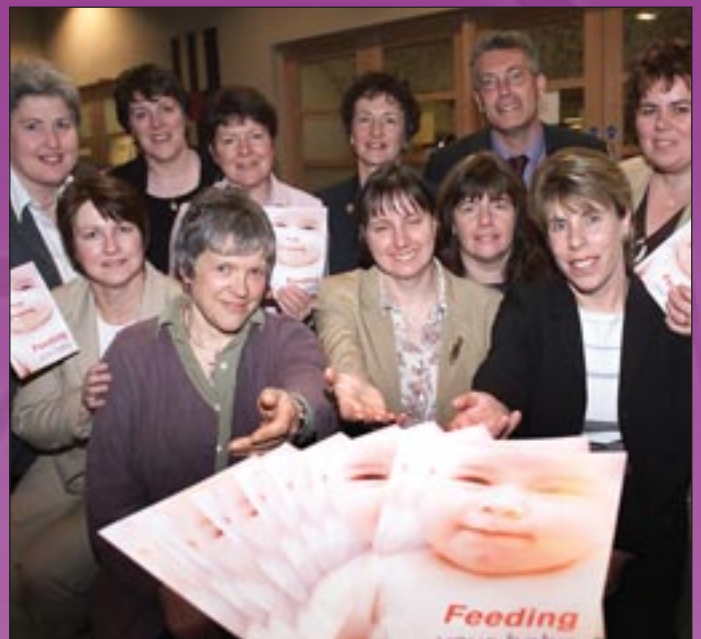
The speakers from the Regional Conference on Breastfeeding which took place at Armagh City Hotel.

We were delighted that so many of you were able to join us for the conference this year, and for those who were unable to attend, the PowerPoint slides which accompanied each of the presentations are available to download from the Breastfeeding section of the HPA website at www.healthpromotionagency.org.uk . Next year's conference will be held on 11 May 2004 in Templepatrick, so put the date in your diary now!