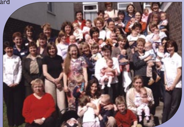
Celebrating breastfeeding at Causeway HSS Trust.